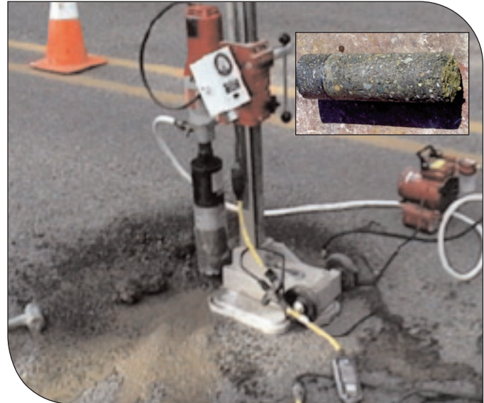
Figure 2 – Extracting FDR cores for unconfined compressive strength testing.

Based on the seismic modulus testing results, the lowest UCS value of 260 psi (1.8 MPa) would roughly correspond to a stiffness of 200,000 psi (1380 MPa), which is considered excellent in terms of the reclaimed base’s ability to support traffic loads and minimize the stress that is transferred to the subgrade.