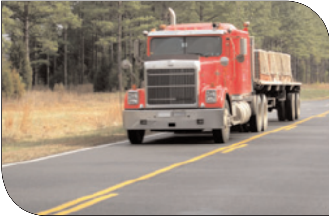
Figure 3 – FDR base provides strong, durable foundation for roadway in South Carolina.