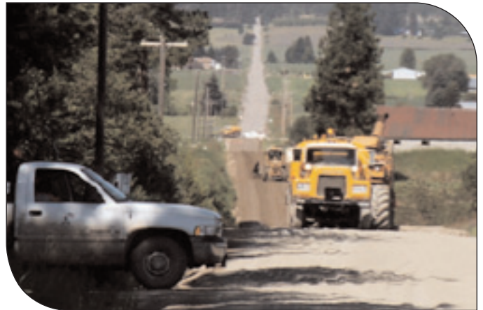
Figure 5 – FDR construction, Spokane County, WA.

Most agencies use equipment called a "reclaimer" to pulverize their old, distressed flexible pavements so that the maximum size of the crushed pavement is no more than 2.5 to 3.0 inches (63 to 75 mm). If thicker sections are required, some agencies add aggregate or soil base material and blend them with the pulverized pavement. Water and cement are then added in either a dry or slurry form to the pulverized material to form a stabilized mixture, which is compacted and becomes the base or subbase of the new pavement structure.