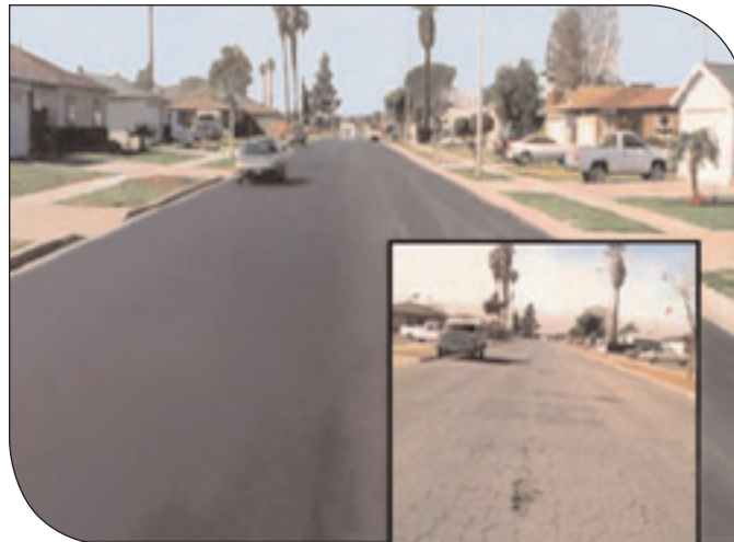
Figure 6 – Before and after photos of FDR for residential street in Westminster, CA.