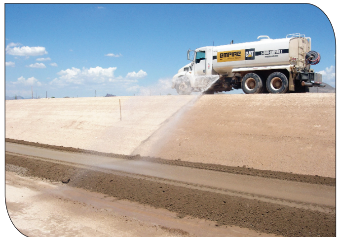
Moist curing with water truck

production rates averaged 2,000 to 2,500 cubic yards (1,500 to 1,900 m 3 ), depending on available approved areas for placement. Placement was commonly alternated each day from the downstream side to the upstream side of the levee. Once each side reached the crest of the soil core, the remaining three foot (0.91 m) thick soil-cement cap was placed in lifts covering the entire width of the levee. The project required a total of 114,200 cubic yards (87,300 m 3 ) of soil-cement, which included 13,900 tons (12,600 metric tons) of portland cement. The total cost of in-place soil-cement was $35.50 per cubic yard ($46.43/m 3 ). This cost included cost of materials, mixing, transporting, placing and curing.