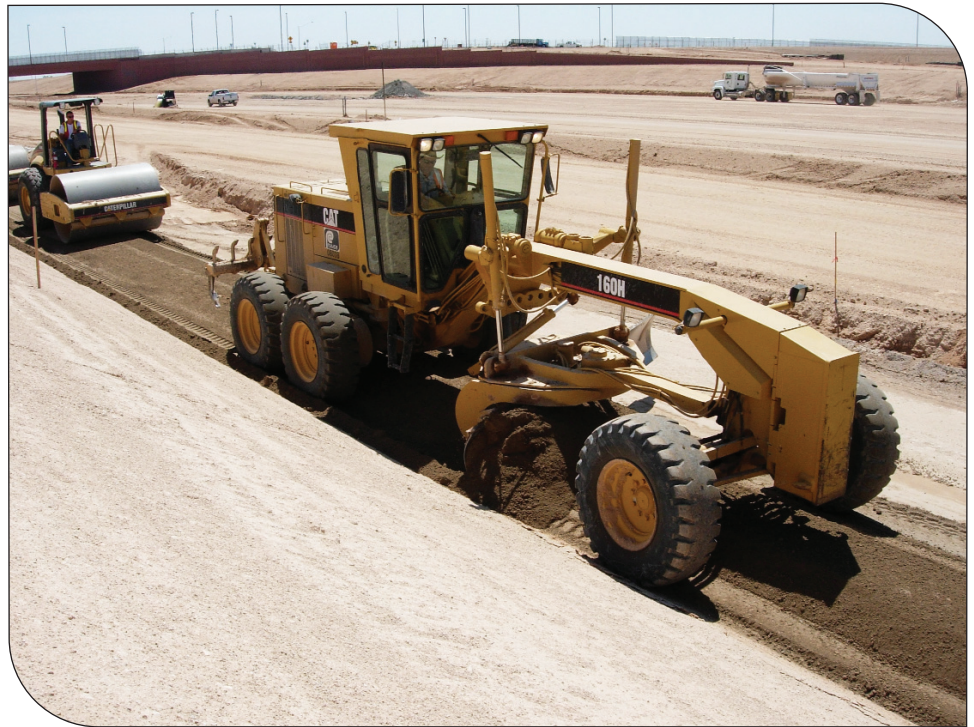
Spreading and rolling soil-cement

The contractor prepared the levee foundation and AMEC, ADOT and ADWR checked and approved the foundation prior to placement of the soil-cement. Foundation preparation included removal of the Holocene alluvial overburden soils to expose the more competent underlying the Pleistocene cemented soils. Once the foundation was prepared and approved, the levee earthen core was constructed. The designer selected to use a structural fill core to reduce the quantity of soil-cement required for the levee and to reduce cost.