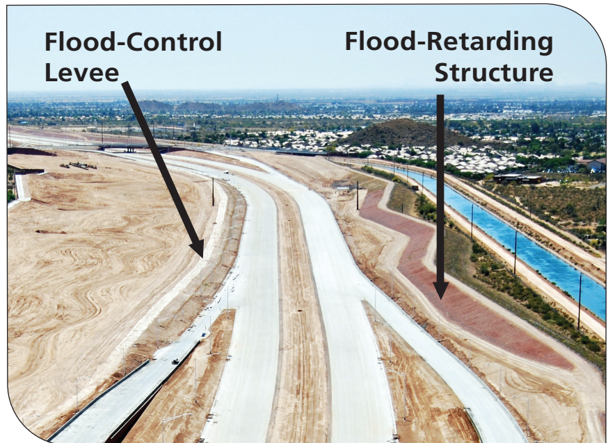
General view of project after substantial completion

Placement of the Red Mountain Freeway within the existing FRS flood pool proved to be the preferred alignment alternative. However, to accommodate the freeway, 100-year flood protection had to be provided and a portion of the existing flood pool capacity had to be reclaimed upstream of the freeway alignment to meet Arizona Department of Water Resources (ADWR) dam safety regulations. This was accomplished by construction of the flood-control levee within the existing flood pool and upstream of the FRS and the removal of approximately 2 million cubic yards (1.5 million m 3 ) of material during the freeway construction project. The soil-