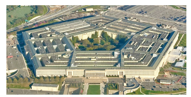
In the U.S., 600 times the amount of concrete in the pentagon is used each year.

after water, sees an annual usage of about 260 million cubic yards in the U.S. In plain terms, that's 600 times the amount of concrete in The Pentagon—annually.